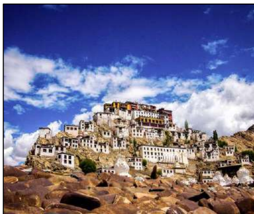
Kashmir-Paradise on Earth

Nature has endowed Kashmir with beauty and is rightly called as “ Paradise on Earth ”.