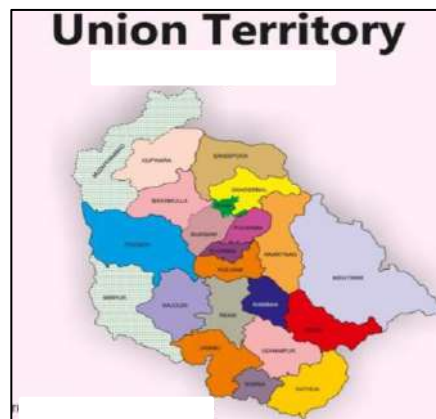
Map of Kashmir

Kashmir is one among the 8 union territories of India. It has been declared as the union territory a few years back.