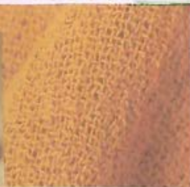
RAMIE IN FIVE STAGES